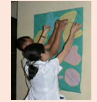
Nursing staff at NHP create educational posters for families.

Families living with Diabetes, or CAH are often admitted for several weeks at a time when first diagnosed or when readmitted for acute illness. Nurses generally have more contact with patients on the ward and this situation was seen to offer an opportunity for nurses to take on a more substantial role in the education process and empower families to better manage their children's health.