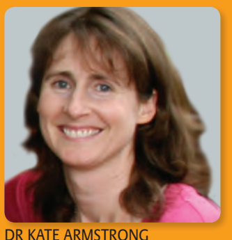
Founder & President

The approach of CLAN is novel. There are no other organisations in the world specifically tackling chronic disease of childhood in resource poor countries in the same way. There are currently no international health policies effectively addressing the issue of non-preventable, non-communicable chronic disease of childhood per se, and as a result, the rights of children to health and health care afforded them by the United