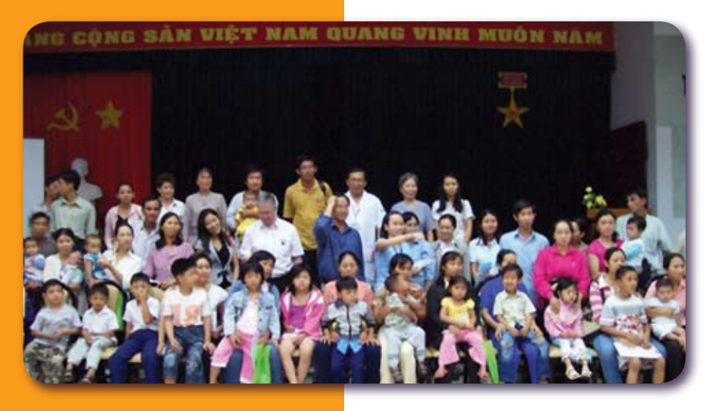
New CAH Club in Ho Chi Minh City Inaugural meeting for CAH families in HCM held in November 2006. Survey of parents conducted by local doctors and parents.

Doctors in Ho Chi Minh City initiated 170HP blood tests for CAH patients, and Hanoi started very soon after. This is an essential tool in CAH management.